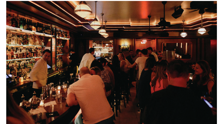
EMPLOYEES ONLY BAR & RESTAURANT