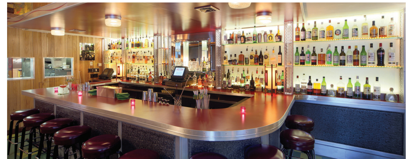
LOS AMERICANOS, RESTAURANT AND BAR