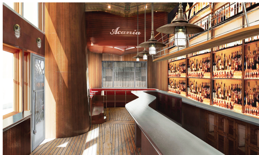
ACANIA BAR & RESTAURANT