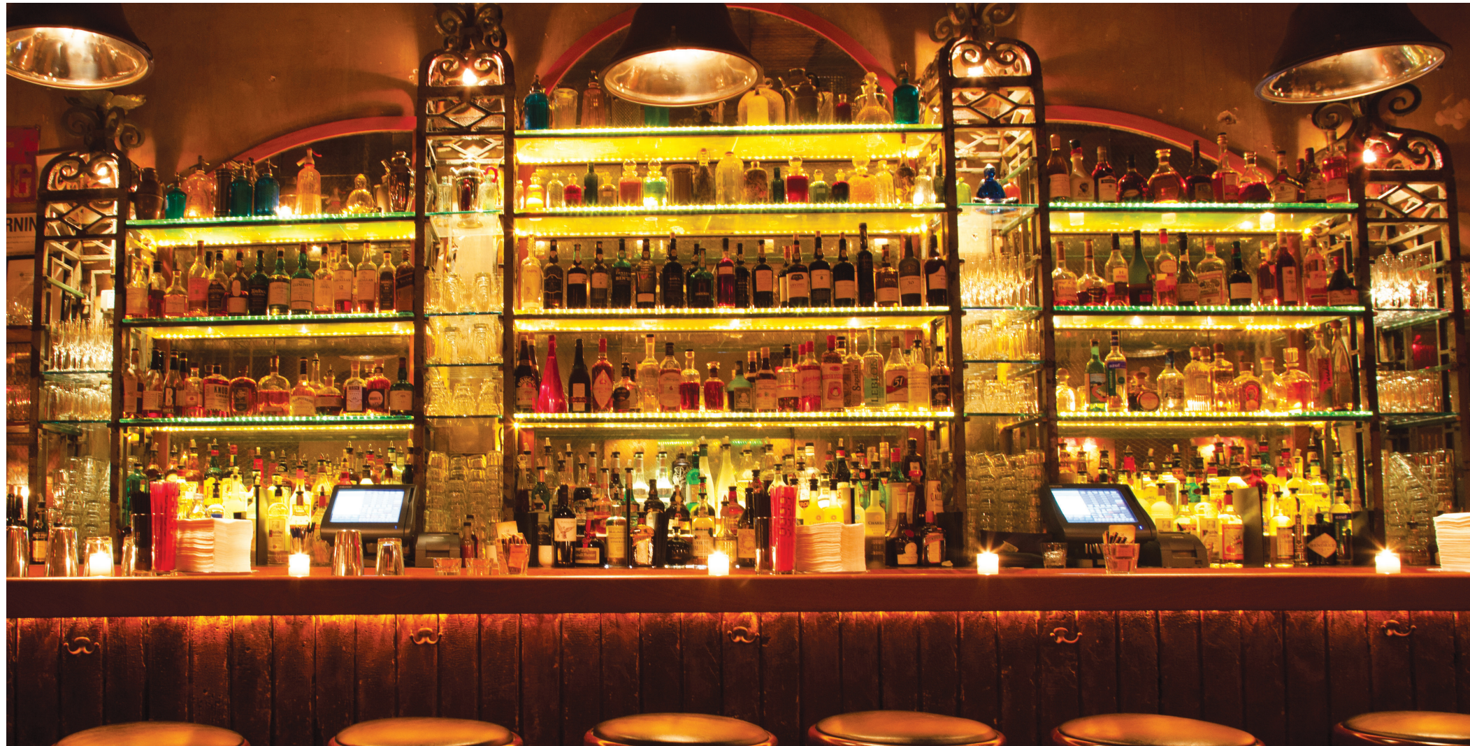
MACAO TRADING CO. BAR & RESTAURANT